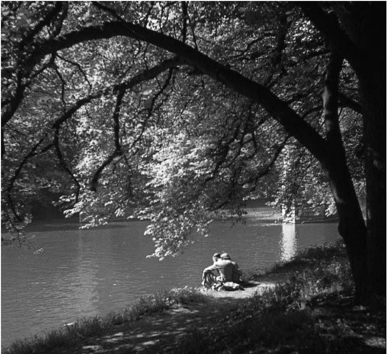
This picture is entitled 'A Place in the Sun' by R. B. Widdercombe of South Shields Photographic Society