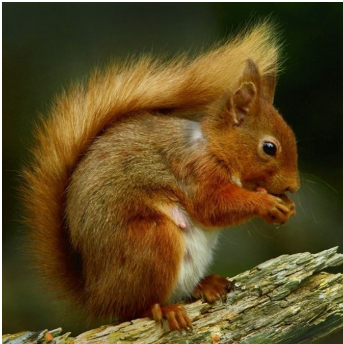
Red Squirrel feeding was taken near Blanchland after a time managed to take this photograph. Camera 50D Lens Canon 70mm - 200mm 2.8 iso 400 f8 shutter speed 200

My other hobby is photographing nature and wildlife it take a lot of time but the results are worth it.