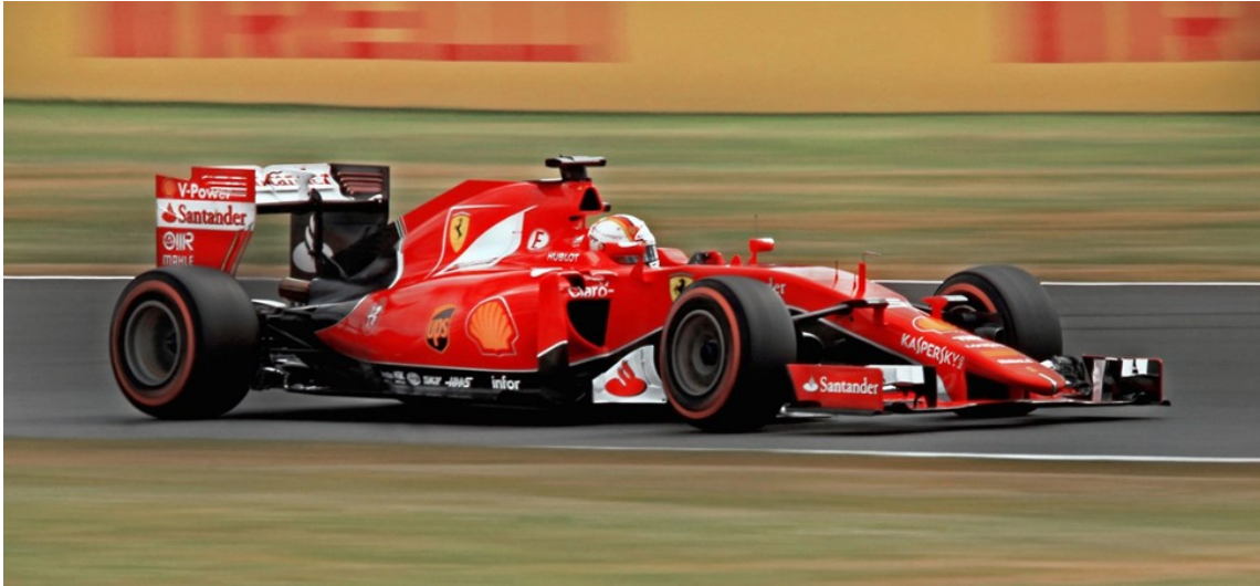
This image of Sebastian Vettel was taken at The British Grand Prix at Silverstone near Northampton. Camera 7D Lens Sigma 100mm - 500mm 5.6 iso 200 f11 shutter speed 60/sec hand held.

I started in photography through my hobby of motor sport starting at Croft racing circuit near Darlington where I learned my skill with the camera before doing other motor racing meetings then moved up to photograph Formula one racing cars. and Moto GP Bikes.