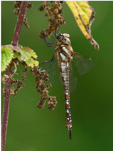
Common Hawker