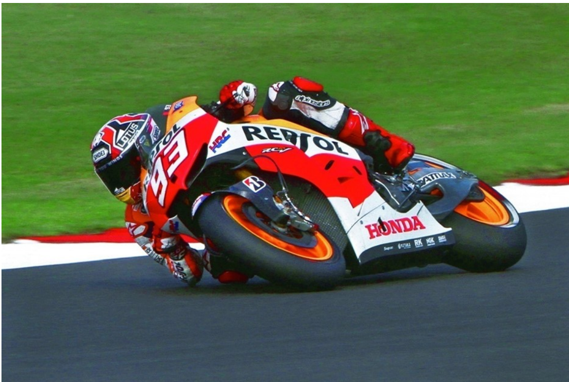
Marco Marques was also taken at Silverstone Camera 7D Lens Canon 70mm - 200mm 2.8 iso 200 f16 shutter speed 125/sec