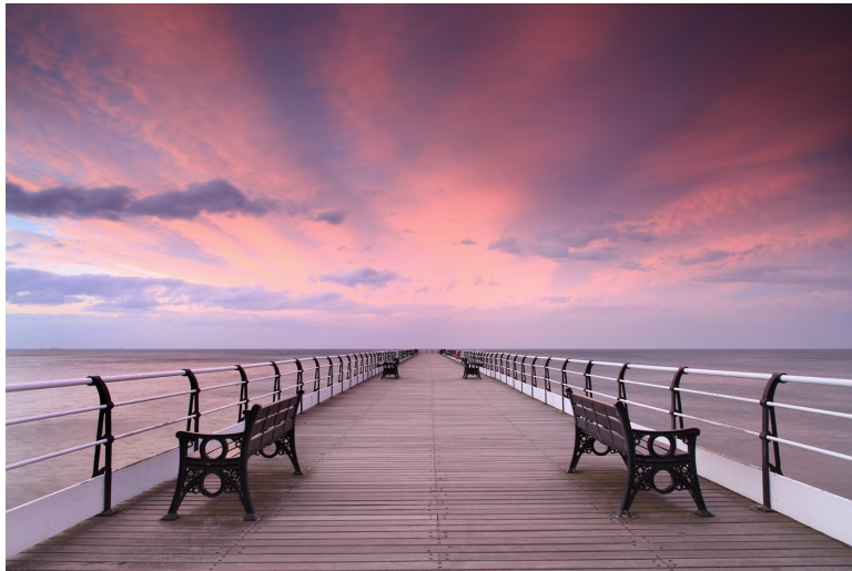
Pier Symmetry

In the early days two portfolios circulated among members inviting comments on prints and slides this was a very successful means of improving the quality of